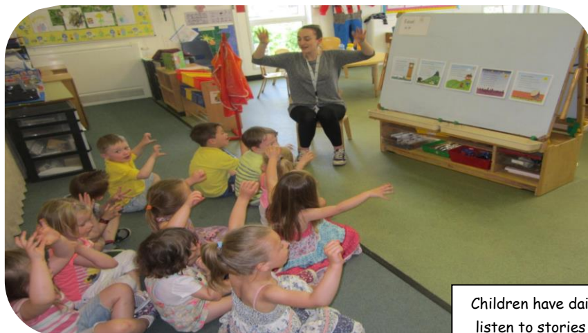
Children have daily opportunities to listen to stories and participate in song and rhyme

Children's understanding of stories is deepened through exploratory activities and play