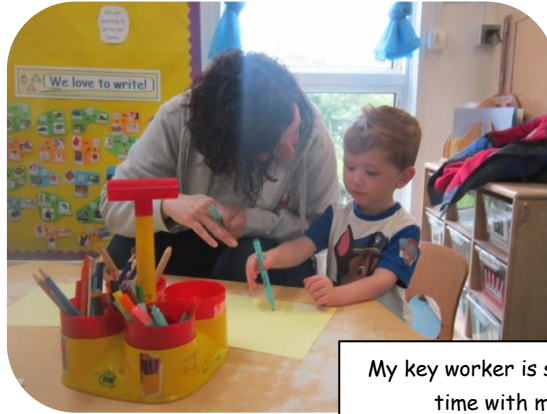
My key worker is spending time with me

Children participate in many small group initiatives to best suit their individual needs.