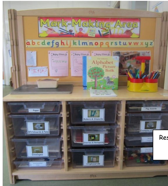
Resources are clearly labelled with words and pictures.