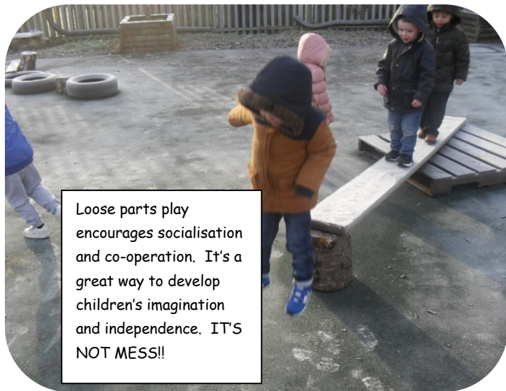
Loose parts play encourages socialisation and co-operation. It's a great way to develop children's imagination and independence. IT'S NOT MESS!!