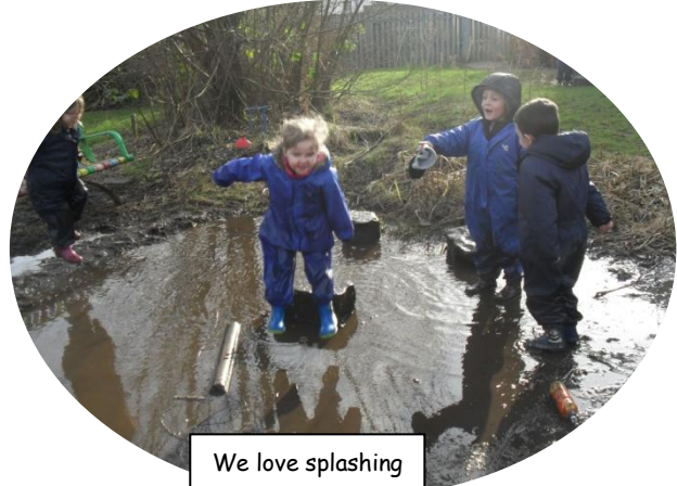
We love splashing in puddles