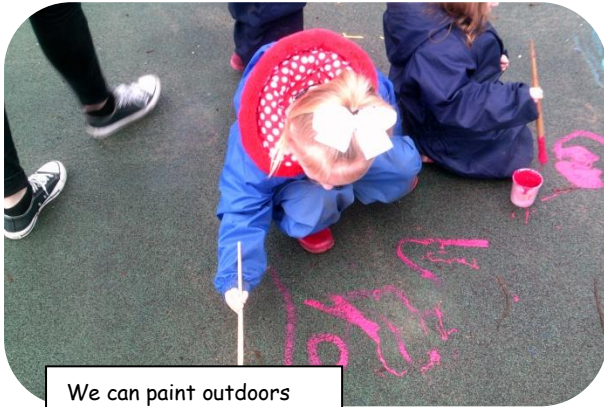
We can paint outdoors

Play Strategy for Scotland: Our Action Plan (2013) Scottish Government(15)