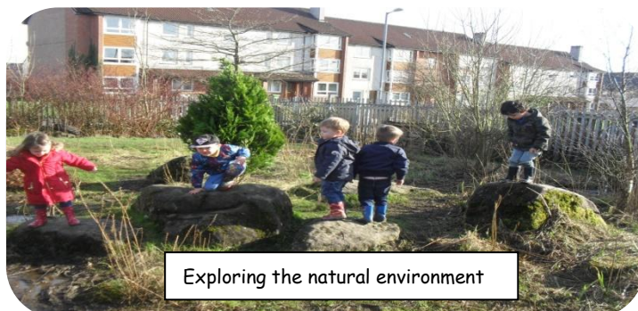
Exploring the natural environment