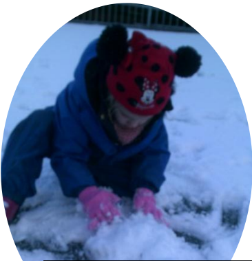
We have fun creating in all weathers